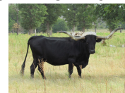
CIRCLE K DONOVAN