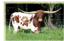
HUBBELLS BLACK BEAUTY